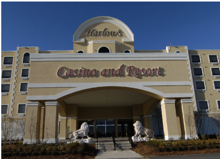
Harlow's has complimentary parking.

The USDA-ARS, Stoneville Laboratory is located near Harlow's Hotel and Casino in Greenville, Mississippi. Major airports recommended for flying to this area include Memphis, TN, Little Rock, AK, and Jackson, MS. Rental cars will be the best option for getting to Greenville, and we may be able to connect people who wish to car pool to Greenville and back depending on arrival and departure times.