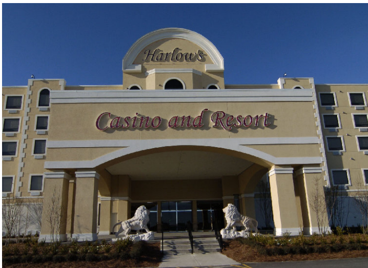
Harlow's has complimentary parking.

The USDA-ARS, Stoneville Laboratory is located near Greenville, Mississippi. Harlow's Hotel and Casino in Greenville is our meeting hotel. Major airports recommended for flying to this area include Memphis, TN, Little Rock, AK, and Jackson, MS. Northwest Airlines does fly between Memphis and Greenville, however, rental cars may be the best option for getting to Greenville. We may be able to connect people who wish to car pool to Greenville and back depending on arrival and departure times.